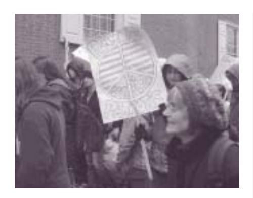
Friends Schools Day of Peace, April 2004.

Last April 4th, three hundred students and faculty from twenty-five Friends schools and a dozen local Meetings braved a cold, driving rain in Philadelphia for a day of workshops, activism, and community-building during the second annual Friends Schools Day of Peace. Despite the weather, the day was filled with positive spirit, which was spread further by good coverage on local TV, radio, and print media.