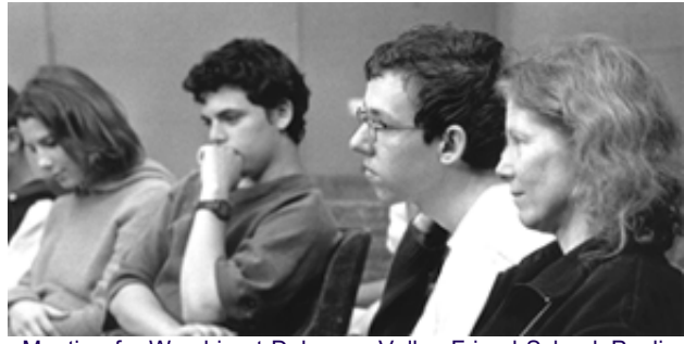
Meeting for Worship at Delaware Valley Friend School, Paoli, PA

we expect to be inspired. We expect wonder. We expect mystery. We expect to remain open to the Spirit. We expect to act respectfully."